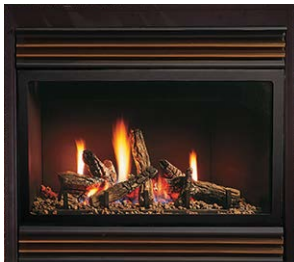
Unit illustrated is a ZDV3622N Zero Clearance Direct Vent Fireplace – Natural Gas, with LOGC50 Log Set, Z36GBP Grill Kit – Classic Polish Brass.