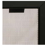
Safety Screen Barrier

Black and Stainless Steel (Covers 36" w x 22 1/2" h)